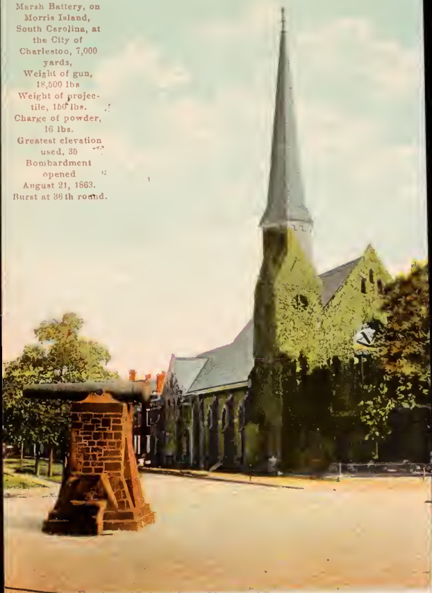
Swamp Angel and Clinton Ave.. Baptist Church Trenton, N. J.

The first gun, an 8-inch Parrott Rifle or 200-pounder, fired from the Marsh Battery, on Morris Island, South Carolina, at the City of Charlesto, 7,000 yards, Weight of gun, 18,500 lbs Weight of projec- tile, 150 lbs. Charge of powder, 16 lbs. Greatest elevation used, 35 Bombardment opened August 21, 1863. Burst at 35 th round.